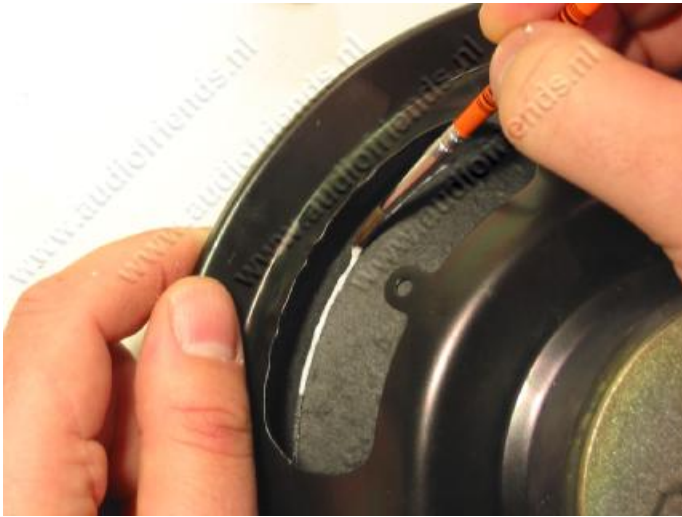
22. If you are precise, make a small track of glue at the back between surround and cone.