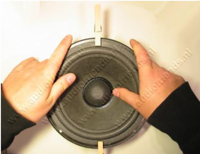
24. Press with your right thumb. You can hear the voicecoil scratching.