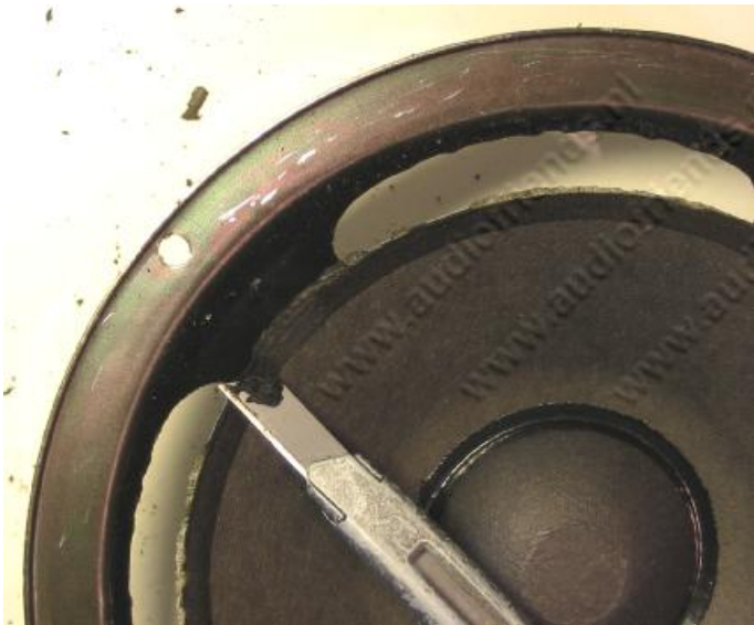
11. Scrape the foam away from the cone.