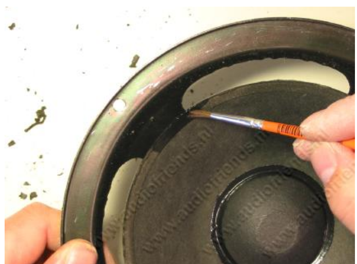
9. Make the cone clean with a soft brush