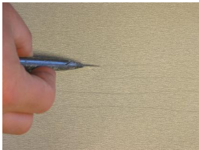
4. Remove this sharp edge with sandpaper.