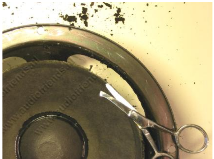
14. Remove it.