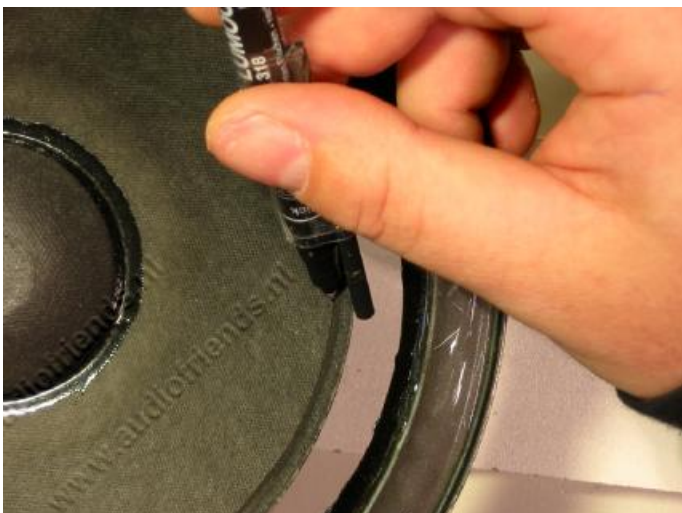
15. If you are precise, draw a line before gluing.