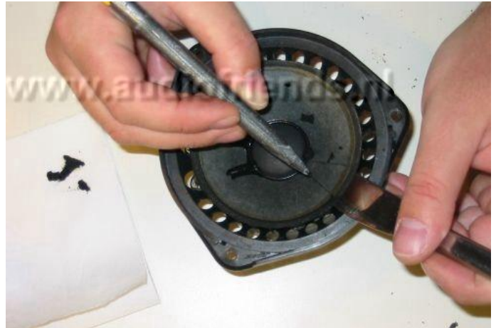
12. If the cone is less solid, use a blunt knife as counterforce.