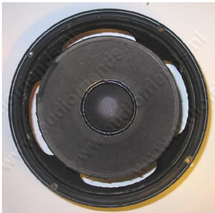
1. Speaker before refoaming.

Refoaming is at own risk. First read the manual before you take action.