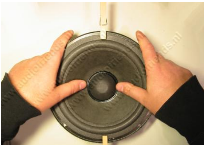
26. (left) Align the cone in the middle. The cone is good aligned when the voicecoil scratches the same at the same pressing with left or with right thumb.