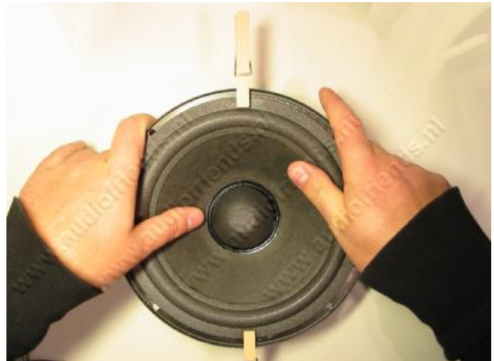
25. Try it with left