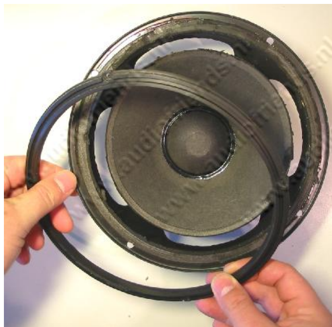
2. Remove the plastic or cardboard ring, if the speaker has one. If the ring is from cardboard, you might get it better lose by splitting the ring near the frame. If the speaker is mounted on the front of the cabinet, the ring is not really necessary. You can mount it later back for a better sight.