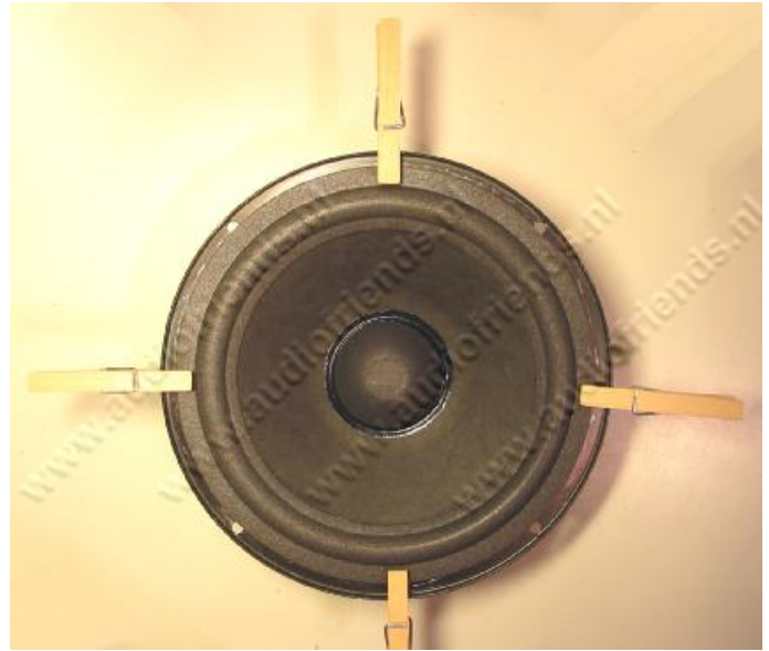
23. Put crosswise clothes-pegs.