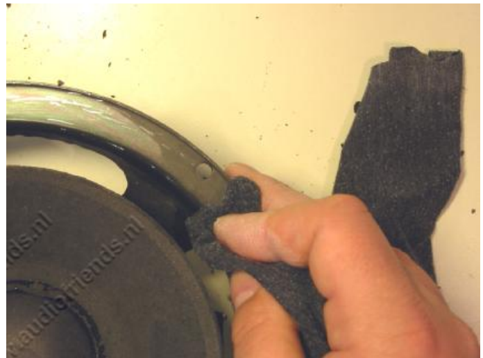
7. Make the inside of the frame clean