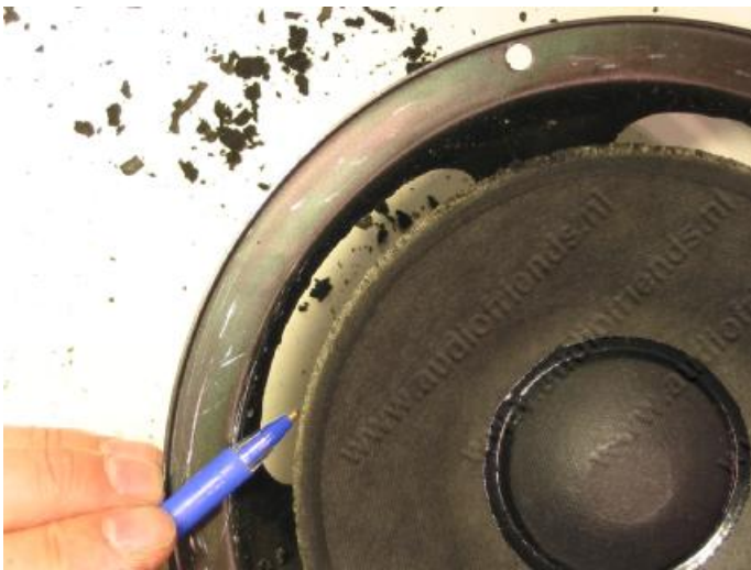
13. There can be an glue edge.